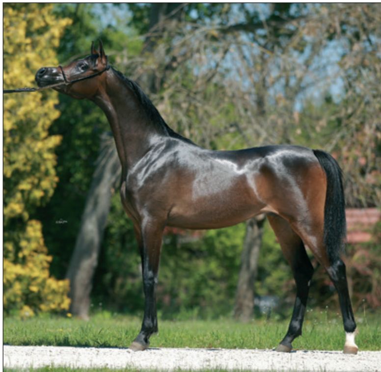
Ferrum (Morion x Ferrmaria by El Omari)