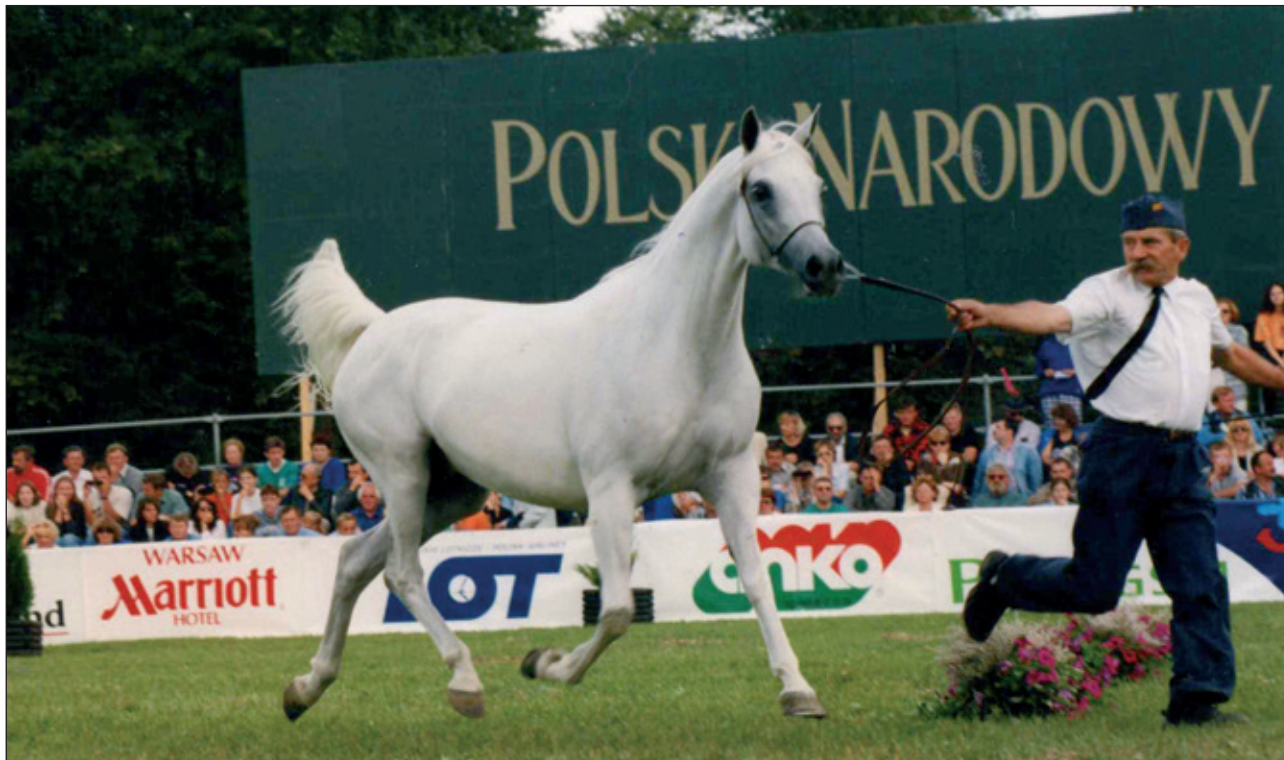
Emilda (Pamir x Emanacja by Eukaliptus)

legendary Estokada (Amurath Sahib x Saga by Hardy), foaled in 1951 in Klemensow and believed to be the main progenitor of the Milordka dam line? Twenty years after the breeding programme of Michalow was established, the twelve-year-old elegant Estebna 1961 (by Nabor) became first Michalow bred European Champion Senior Mare almost as if she was the first sign of the stud's spectacular success. She has started a long list of European champions representing the family of Milordka born at the Polish state stud.