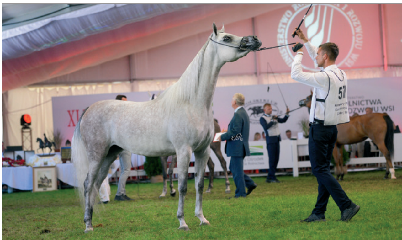
El Esmera (Sahm El Arab x Esmeraldia by QR Marc)