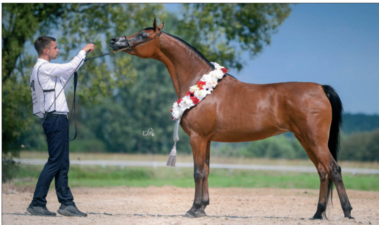
Protekcja (Ekstern x Pentra by Poganin)