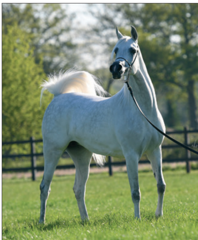
Wildona (Shanghai EA x Wilda by Gazal Al Shaqab)