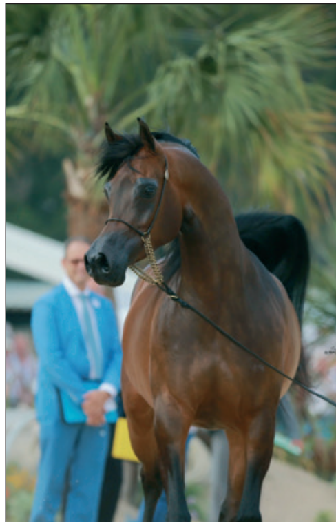
Pustynia Kahila (Kahil Al Shaqab x Pustynna Malwa by Ekstern)