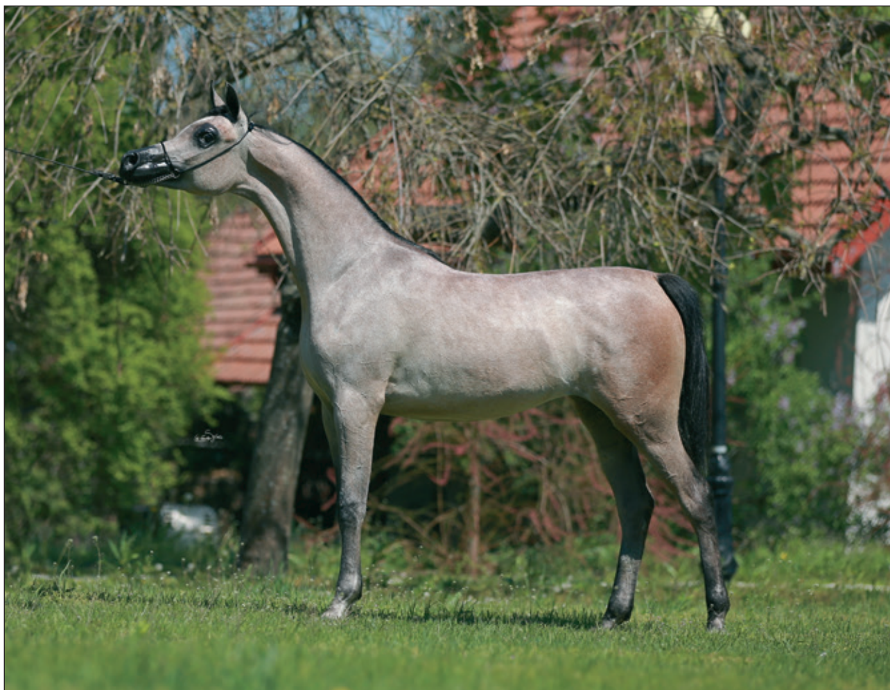
El Medida (Morion x El Medara by Shanghai EA)

The impressive number of Michalow bred European champions indicates the great genetic potential stored in their invaluable herd of Arabian horses. And although crossing two superb show champions does not always guarantee outstanding results, a high concentration of the precious genes has helped the stud create one of the most admired and cherished breeding programmes in the world. The balance between the preservation of existing families and careful selection of the highest quality breeding material is the key to the stud's inspiring international success. Keeping a variety of dam lines adds greatly to the genetic diversity of the bloodstock while choosing only the most prepotent individuals ensures the unprecedented breeding progress so palpable in the 68 years of Michalow's existence. 65 European Champion titles in the last 48 years is an accomplishment no other stud farm in the world can