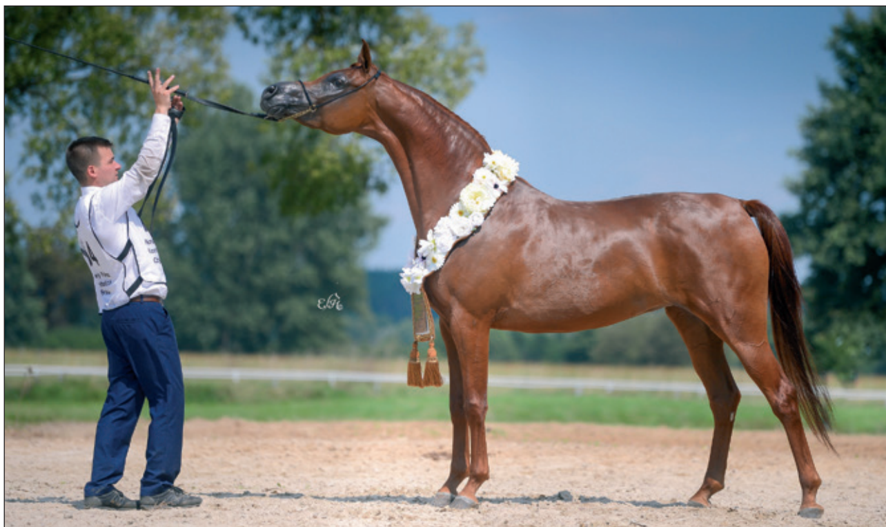
El Bellisima (Ascot DD x Ekliptyka by Ekstern)

refined grey El Medida (Morion x El Medara by Shanghai EA), will compete in the two-year-old fillies' section. So far, she was unconquered at the Bialka Junior Spring Show two years in a row. In 2020, she won a gold medal in the Yearling Fillies Championship, whereas this year she became Unanimous Gold Champion Junior Filly as well as Best in Show, leaving all the other competitors behind. In 2021, El Medida also won her class during the prestigious Mediterranean and Arab Countries Arabian Horse Championships in Menton, France. Another junior female contender, the three-year-old charismatic grey El Esmera (Sahm El Arab x Esmeralda by QR Marc), represents a very special branch of E-line. As the granddaughter of the mesmerising Emandoria , El Esmera is under a lot of pressure. Up to this point, her achievements include the silver medal in the Junior Fillies Championship at the 2021 Bialka Junior Spring Show and the Bronze Champion Junior Filly title at the 2021 Prague EuroCup. During this year's Polish National Show, she won the class of three-year-old fillies and the Top Five title in the Junior Fillies Championship. The only senior contender coming from the Milordka dam line is the four-year-old classy chestnut El Bellisima (Ascot DD x Ekliptyka by Ekstern). Her