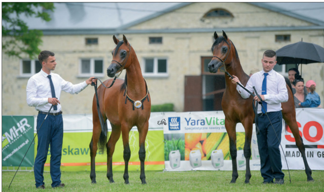
El Maestro (Morion x El Medonia by Shanghai EA) and Porto Rico (Zloty Medal x Parmania by Kahil Al Shaqab)

and she won the Top Five Junior Filly title during the Polish Nationals in Janow Podlaski later on in the year. Her career as a senior mare also started on a high note. This year, Protekcja won her class at the significant Menton show with a spectacular total score of 93.17 points. After this successful start of the European show season, she managed to win three silver medals; one at the Polish Nationals and another two at the Intercup and EuroCup in Prague. The dam lines of Selma d.b. and Rodania d.b. will be represented by two yearlings who have just started their show career. The zingy Zlota Mysl (Equator x Zlota Bulla by Kahil Al Shaqab), sired by the unconquered European Champion Equator, tail female traces back to one of the first Michalow bred European winners, the wonderful Zazula. Such aristocratic ancestry seems obliging hence Zlota Mysl is expected to have some successes as a show horse already. And she does indeed. She won her class and the Top Five title during the 2021 Bialka Junior Spring Show and became Polish National Silver Champion Yearling Filly in Janow Podlaski shortly after. Her classy stable companion Porto Rico (Zloty Medal x Parmania by Kahil Al Shaqab), tracing back to Rodania d.b. through his remarkable great-granddam Palmira 1995 (Monogramm x Palestra by Penitent), is closely related to the 2020 Silver European