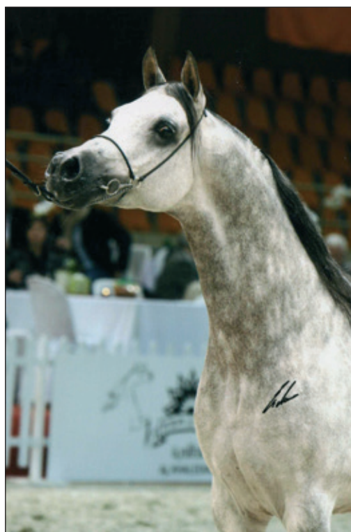
Esparto (Ekstern x Ekspozycja by Eukaliptus)