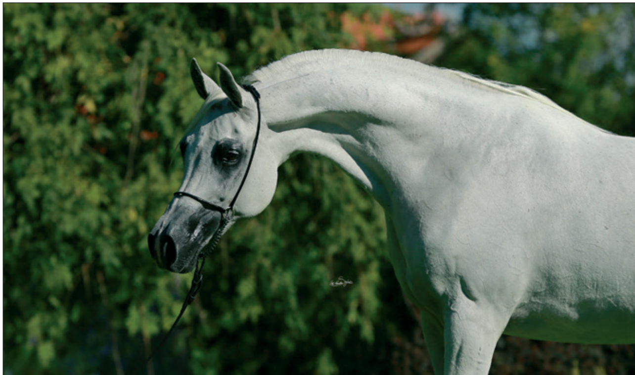
Zagrobla (Monogramm x Zguba by Enrilo)