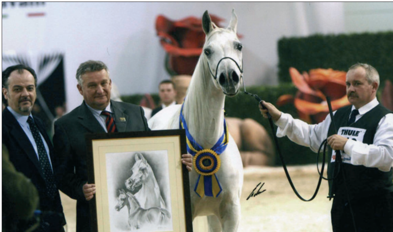
Zagrobla (Monogramm x Zguba by Enrilo)

full potential until last year, when the phenomenal dark bay Ferrum 2019 (Morion x Ferrmaria by El Omari) became Gold Champion Yearling Colt at the European Championships in Prague.