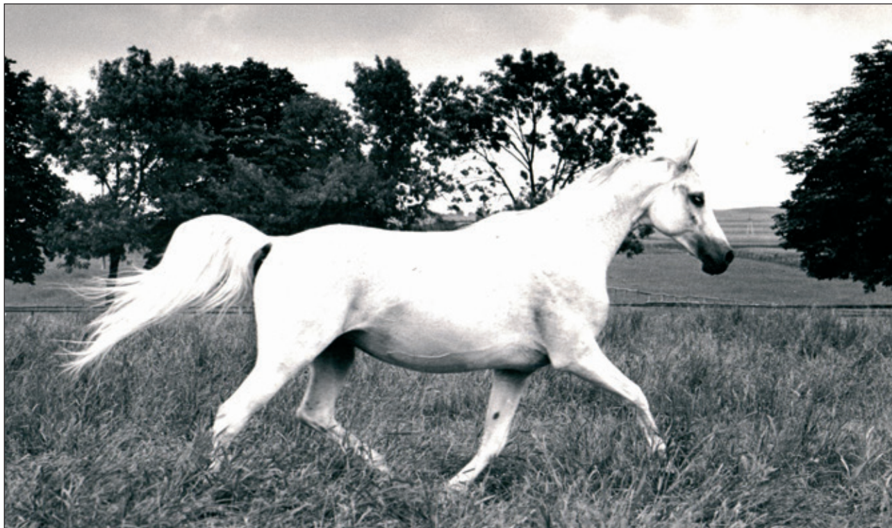
Estebna (Nabor x Estokada by Amurath Sahib)

I t is commonly believed that the progeny of two successful show horses do not necessarily need to exhibit all the admired traits of their sire and dam or to follow in their footsteps as show champions. Genetics, as we know, can be quite tricky, which in turn makes breeding an unpredictable venture full of unexpected outcomes. It is enough to look at some full siblings to understand that mating of the same individuals may each time bring a totally different result from a phenotypical point of view. A similar level of uncertainty is related to crossing two show winners. However, it happens that some families or strains carry a great genetic potential which continually results in producing remarkable representatives of the Arabian breed who become successful show champions.