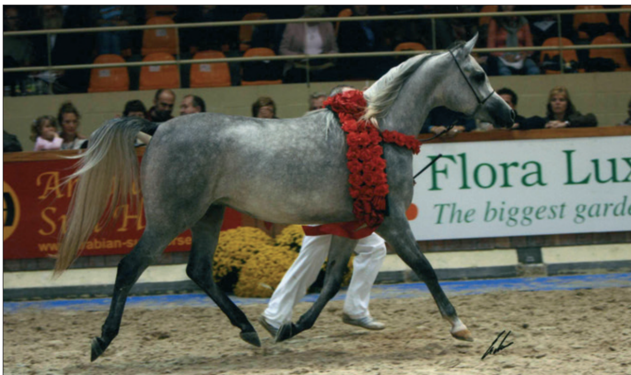
Emandoria (Gazal Al Shaqab x Emanda by Ecaho)