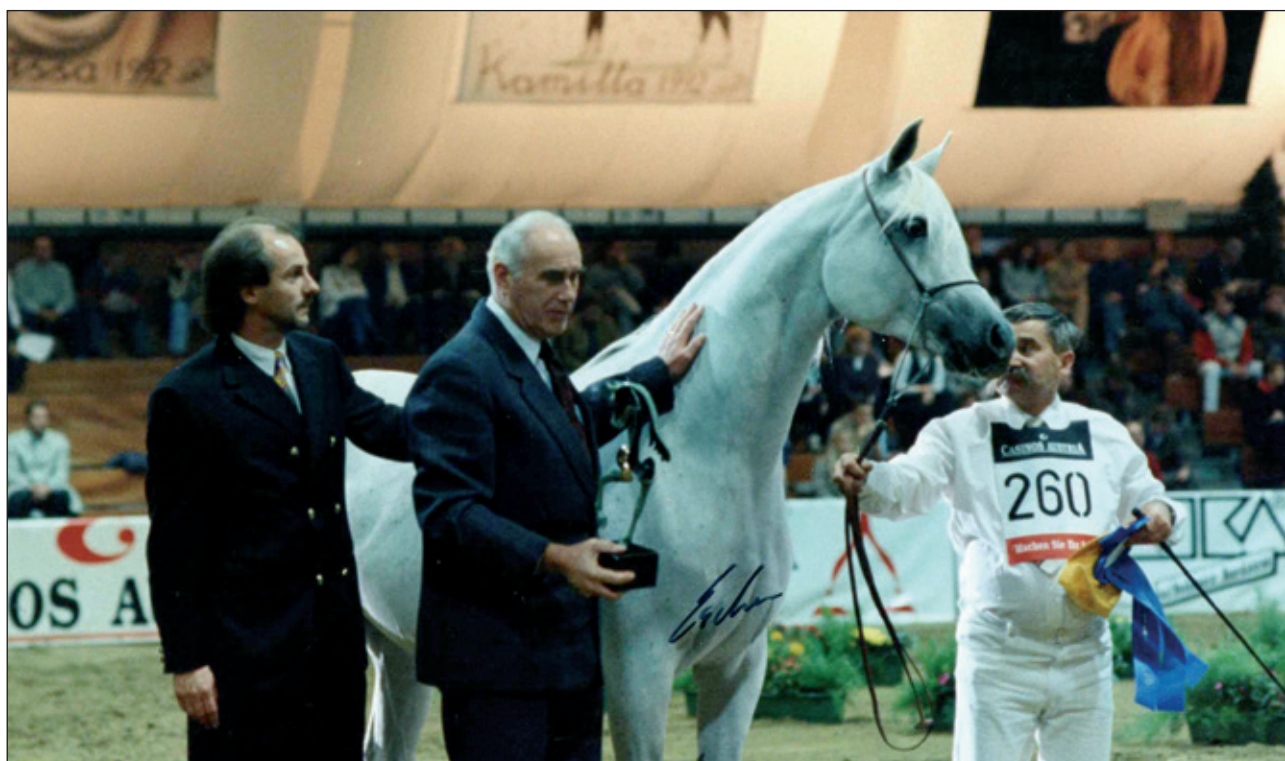
Emanacja (Eukaliptus x Emigracja by Palas)