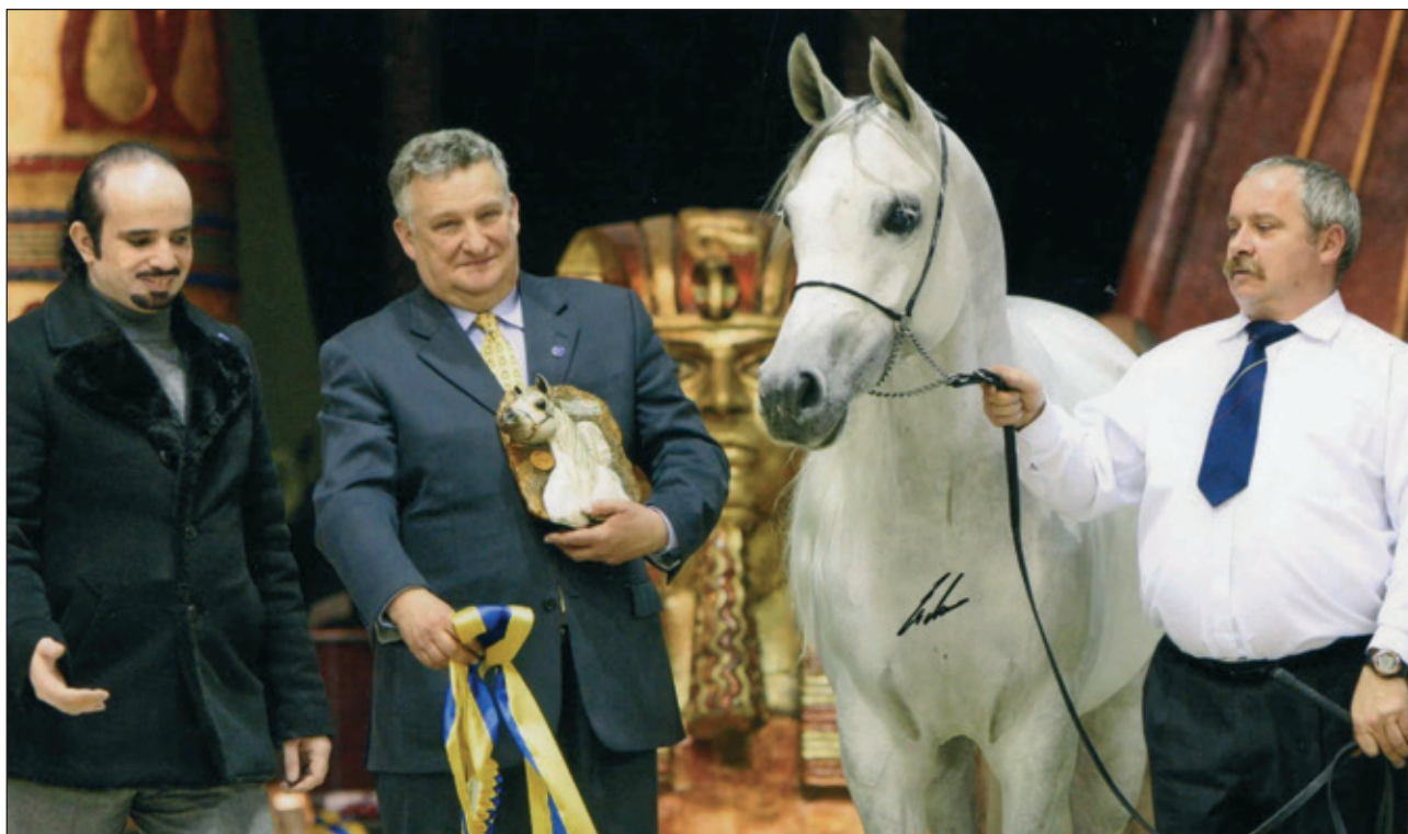
Emandoria (Gazal Al Shaqab x Emanda by Ecaho)

Qatar x Emanda by Ecaho) became Silver Champion Senior Mare last year, but it was Emanda's older daughter, the matchless Emandoria 2004 (by Gazal Al Shaqab), who ended up on the podium for a record number of times. She started her lustrous show career as a yearling in 2005 and she won the titles of Vice-champion and Champion Junior Filly two years in a row. As a senior mare, she became Bronze Champion in 2009 and Gold Champion in 2010 and 2013. Another phenomenal family member who tail female traces back to Estebna, the striking bay Equator 2010 (QR Marc x Ekliptyka by Ekstern), was never defeated at the European Championships. He became gold medallist four times; in 2012 as a two-year-old colt and three times as a senior male competitor (2014, 2015 and 2018). In the same year that Equator triumphed as a junior colt, his dam's full brother Esparto 2002, sired by the 2000 European Champion Ekstern, won a silver medal as a senior stallion. This is not an exhaustive list of all the European champions descending from the esteemed E-line, however it still paints a picture of a prodigious family, whose magnificent members are more than capable of taking European showgrounds by storm.