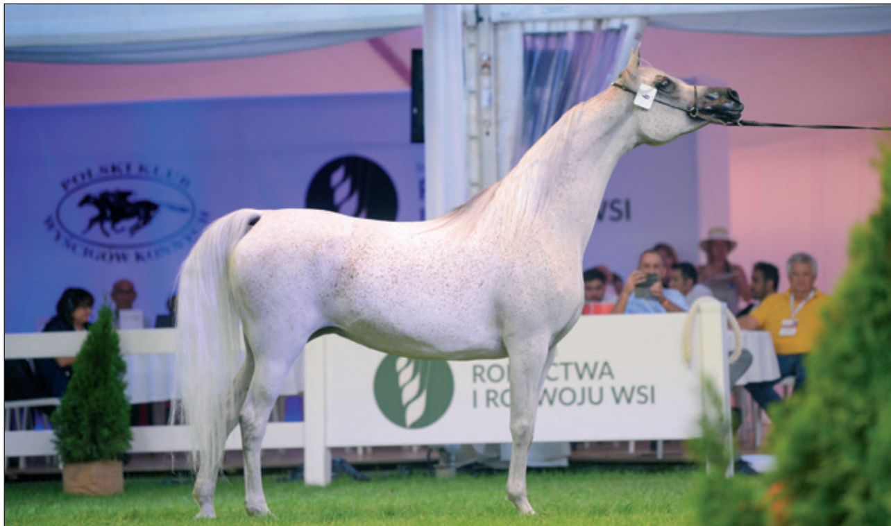
Emandorissa (Abha Qatar x Emanda by Ecaho)