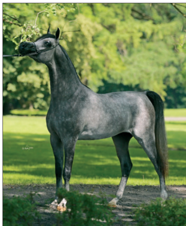
Ptolemeusz (Zloty Medal x Parmana by Al Maraam)