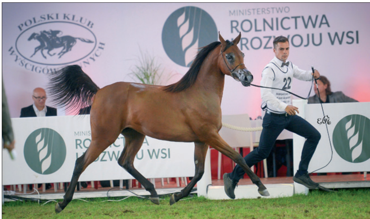
Zlota Mysl (Equator x Zlota Bulla by Kahil Al Shaqab)