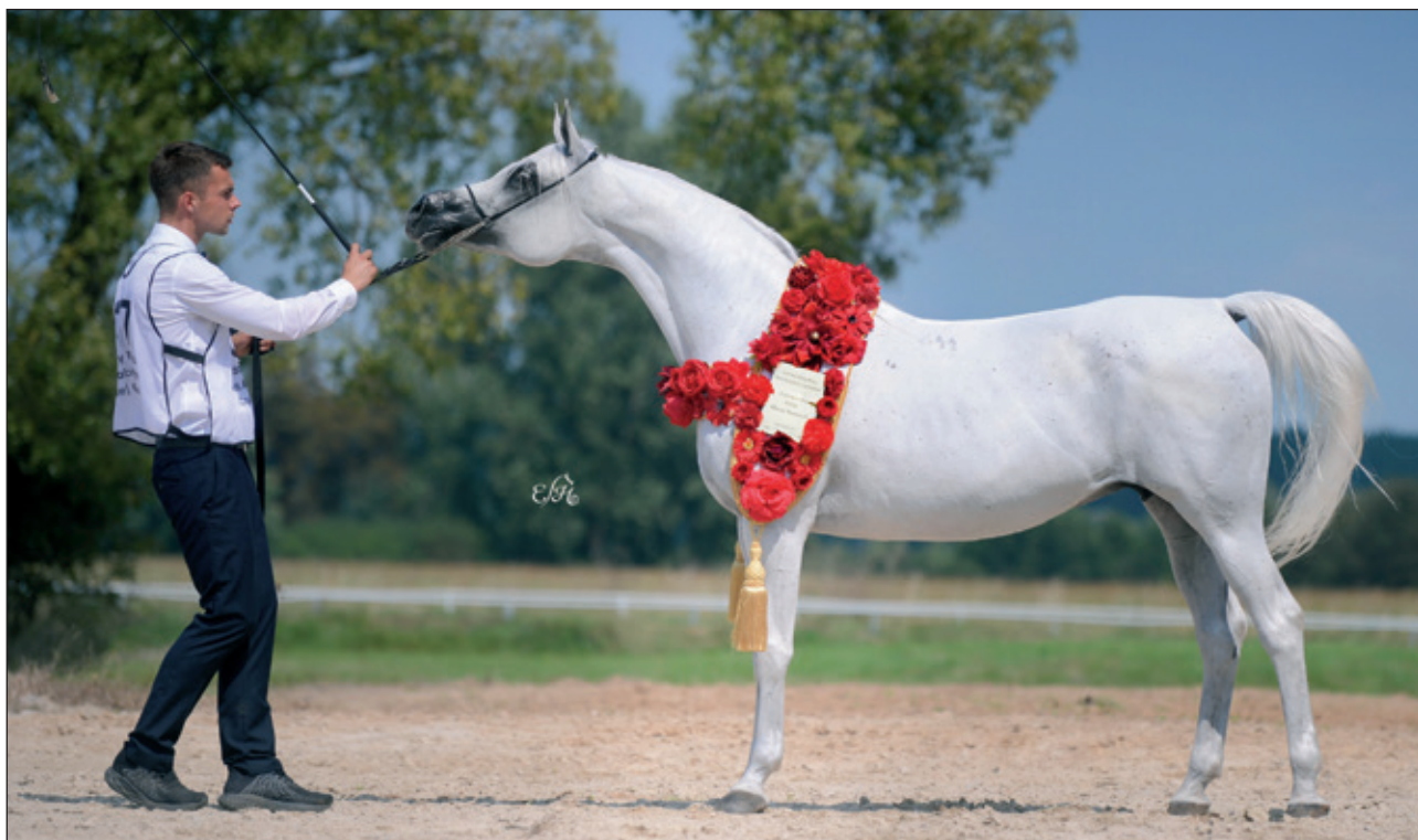
Palanga (Ekstern x Panika by Eukaliptus)