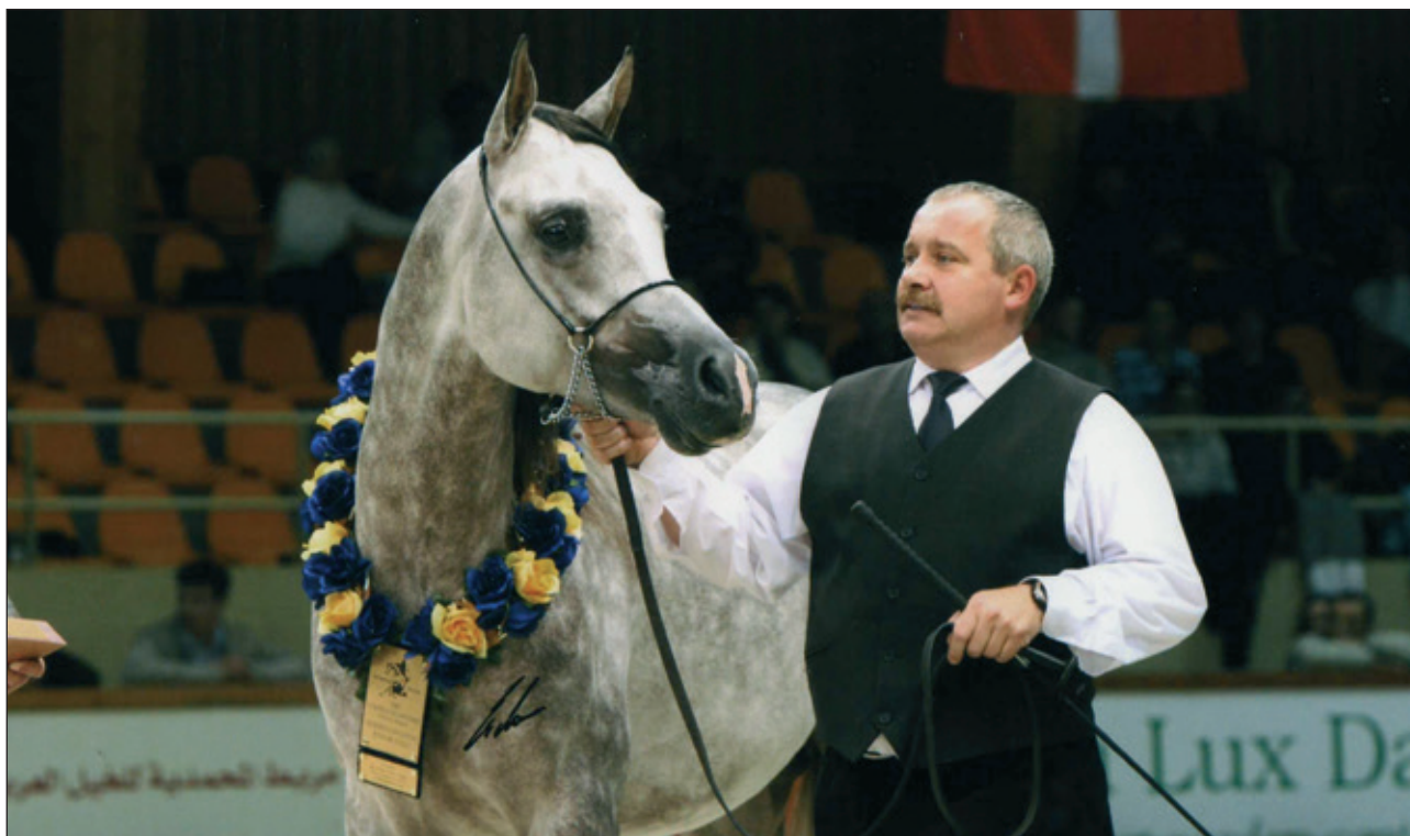
Kabsztad (Poganin x Kwestura by Monogramm)

Taraszcza 1937 (Enwer Bey x Gazella II by Koheilan d.b.), bred by Janow Podlaski Stud but captured by the Soviet troops and taken to Russia in 1939. The most renowned members of this sub-family include the 2003 European Champion Junior Mare and 2006 Vice-champion Senior Mare Palanga 2002 (Ekstern x Panika by Eukaliptus), the 2013 Bronze Champion Yearling Filly and 2014 Gold Champion Junior Filly, Piacolla 2012 (Enzo x Polonica by Ekstern), whose dam is Palanga's full sister, as well as the 2019 Silver Champion Senior Mare Poganinka 2015 (El Omari x Pentra by Poganin), whose powerful animated trot has been highly appreciated by the judges.