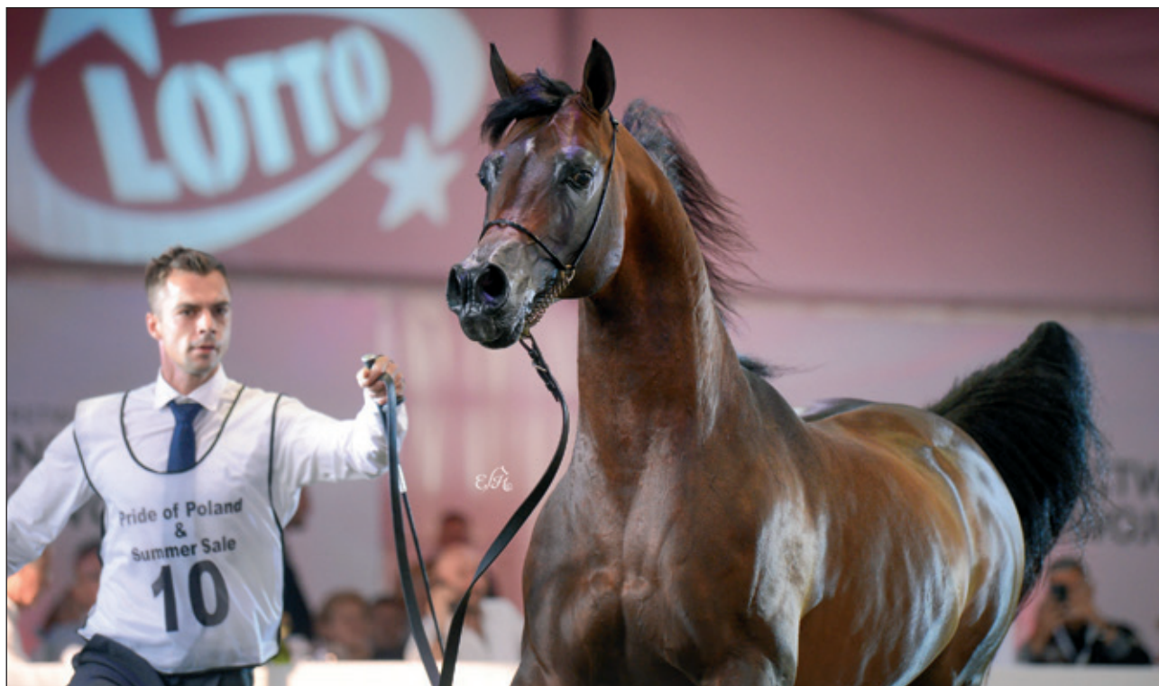
Equator (QR Marc x Eklipyka by Ekstern)