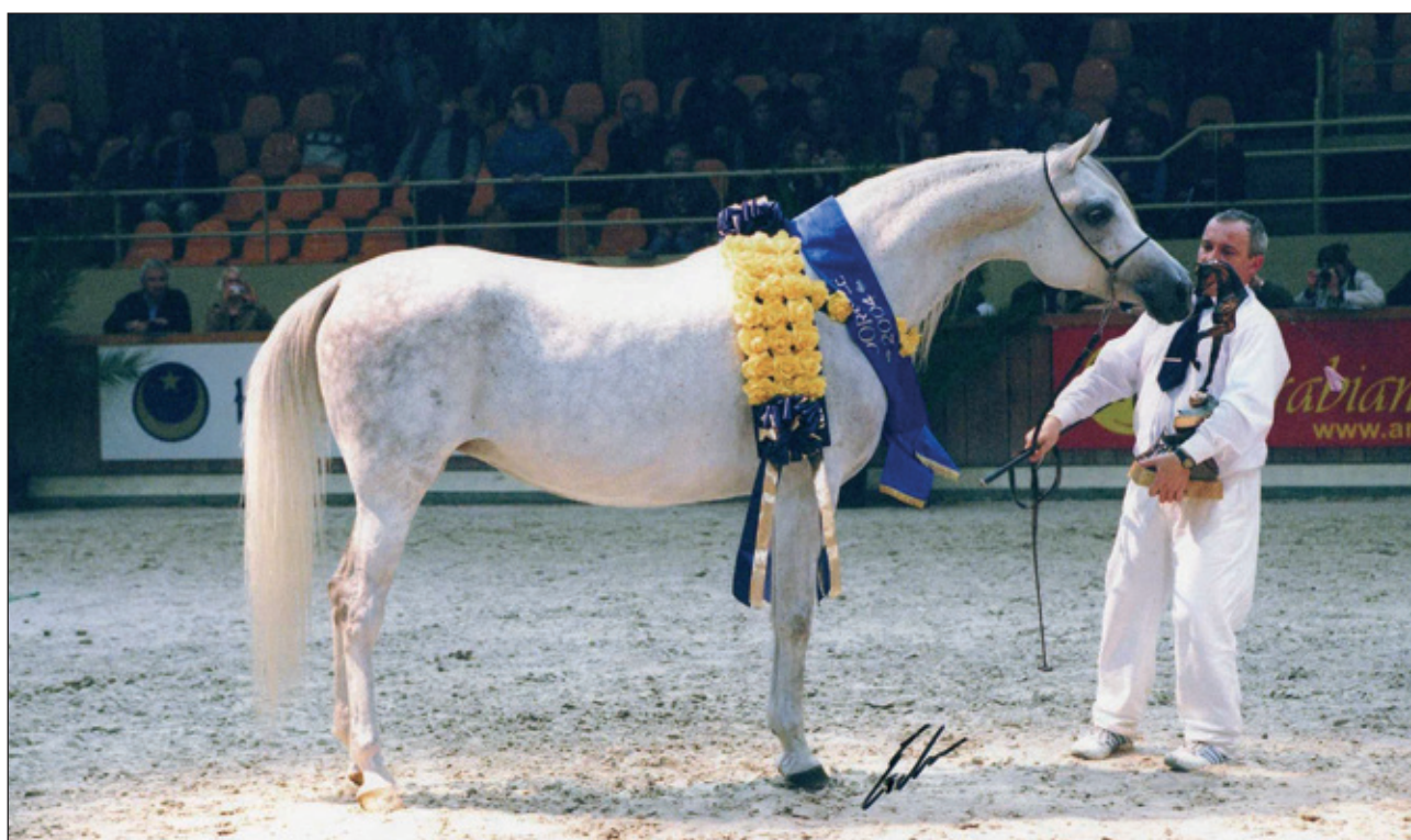
El Dorada (Sanadik El Shaklan x Emigrantka by Eukaliptus)